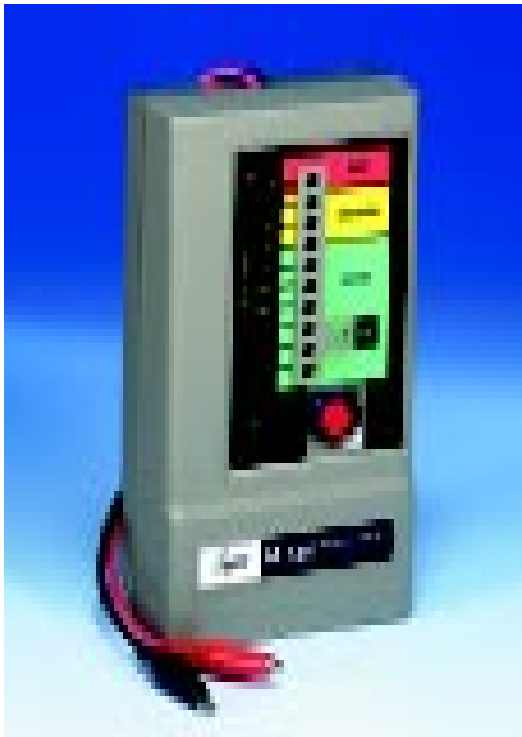
DETECT THE CONDITION OF MOTOR WINDING INSULATION BEFORE IT'S TOO LATE!