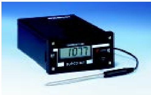
A COMPLETELY SELF-CONTAINED 120/220 VAC, ON/OFF TEMPERATURE CONTROLLER WITH DIGITAL DISPLAY.